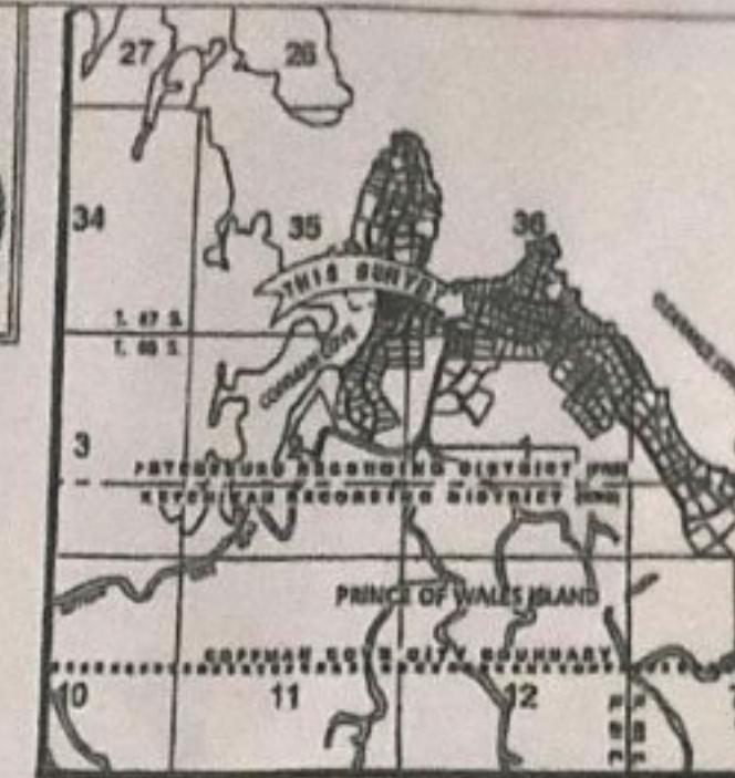
VICINITY MAP 1" = 2040'