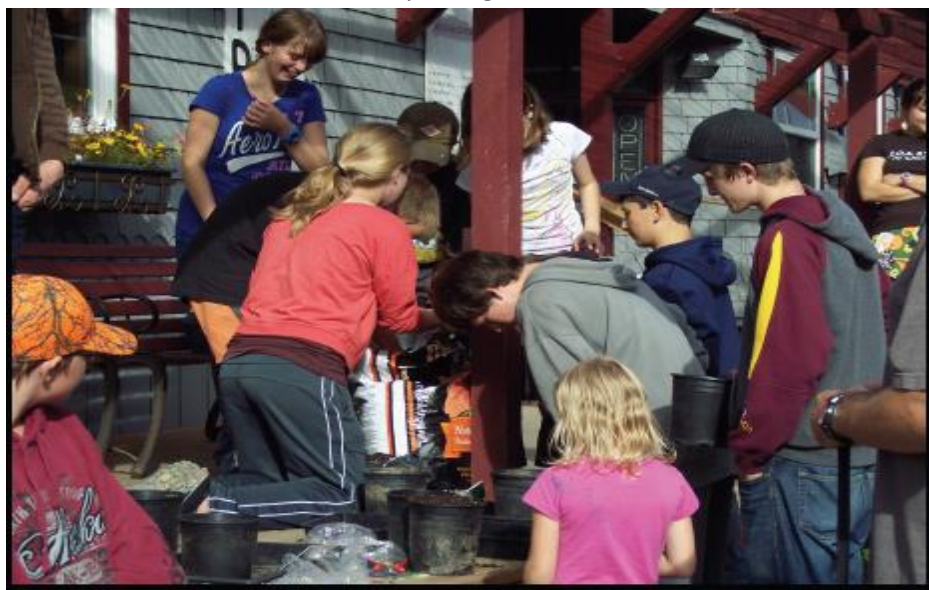
Well-attended master gardener's class at the Community Library.